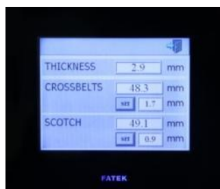
Touchscreen integrated on control panel