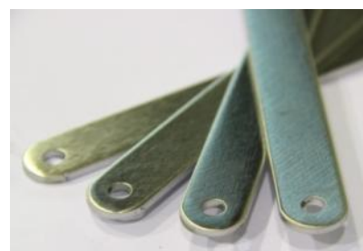
Deburring and edge rounding small parts