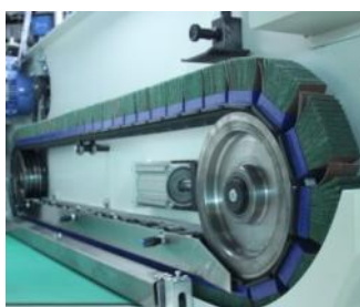
35° angled cross belts with motorized pressure and thickness regulation