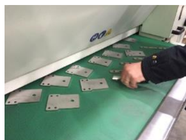
Feeding multiple parts on DM1600 C