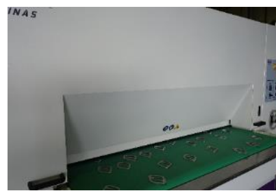
Small stainless steel parts edge rounding